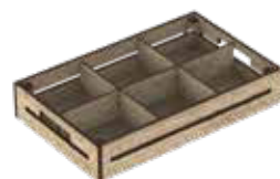
MARKET BOX LARGE WITH 6 PARTITIONS L 53 W 33 H 10 cm