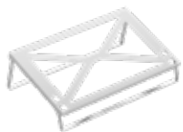
For large Market box/tray L 53 W 34 H 16,5 cm