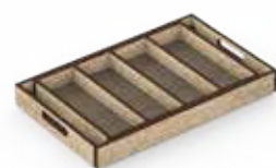
MARKET TRAY LARGE WITH 4 PARTITIONS L 53 W 33 H 7 cm