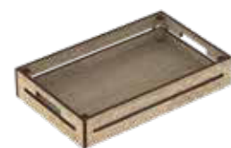
MARKET BOX LARGE L 53 W 33 H 10 cm