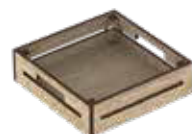
MARKET BOX SMALL L 33 W 33 H 10 cm