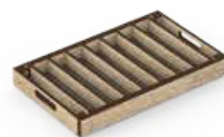
MARKET TRAY LARGE WITH 7 PARTITIONS L 53 W 33 H 7 cm