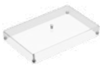
For large Market box/tray L 54 W 34 H 7 cm