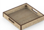
MARKET TRAY SMALL L 33 W 33 H 7 cm