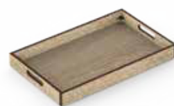
MARKET TRAY LARGE L 53 W 33 H 7 cm