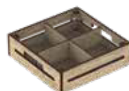
MARKET BOX SMALL WITH 4 PARTITIONS L 33 W 33 H 10 cm