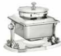
CLASSIC SOUP STATION SINGLE

L 73,5 W 37 H 42 cm ⚡ 700 W | 🔥 gel fuel