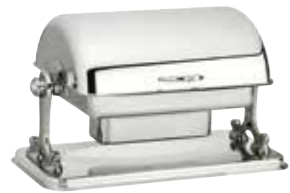
CLASSIC CHAFING DISH OBLONG

L 73,5 W 45 H 42,5 cm ⚡ 700 W | 🔥 gel fuel