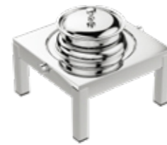
SOUP STATION ROUND