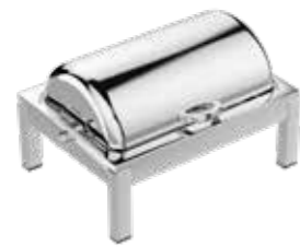
WONDER CHAFER OBLONG