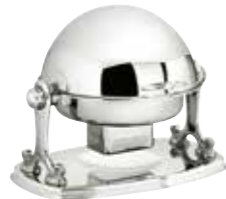
CLASSIC CHAFING DISH ROUND

L 73,5 W 45 H 42,5 cm ⚡ 700 W | 🔥 gel fuel