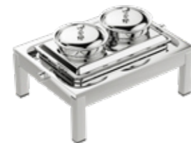
SOUP STATION OBLONG