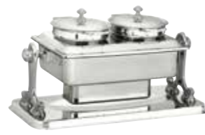
CLASSIC SOUP STATION OBLONG

L 61,5 W 49 H 45,5 cm ⚡ 500 W | 🔥 gel fuel