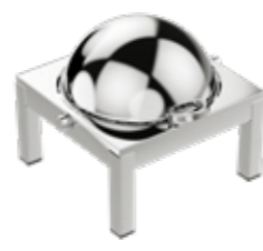
WONDER CHAFER ROUND